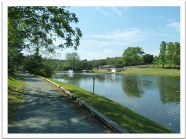
Star Trail Loop

The Star Trail loop covers a significant portion of the campus. The trail loop is located between the apartment buildings west of the campus and the elementary school. Although the elementary school is visible from the trail, there are no pedestrian crossing treatments on Woodrow Wilson Avenue where the trail lines up with the school.