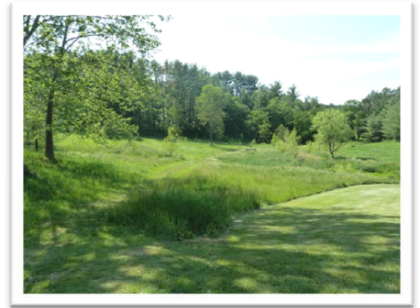
View of service road from Star Trail (looking west)

Several unpaved service roads are used and maintained on the campus. The team observed that many of these roads are close to the apartment buildings west of the campus and the Star Trail. If improved, they could provide an accessible, alternate walking route to US250. Additionally the team noted that emergency vehicle access to and from the campus is limited to Woodrow Wilson Avenue, which is not ideal. If the service roads could support emergency vehicles, the pathways could provide an additional benefit to improving walking and biking to schools on campus.