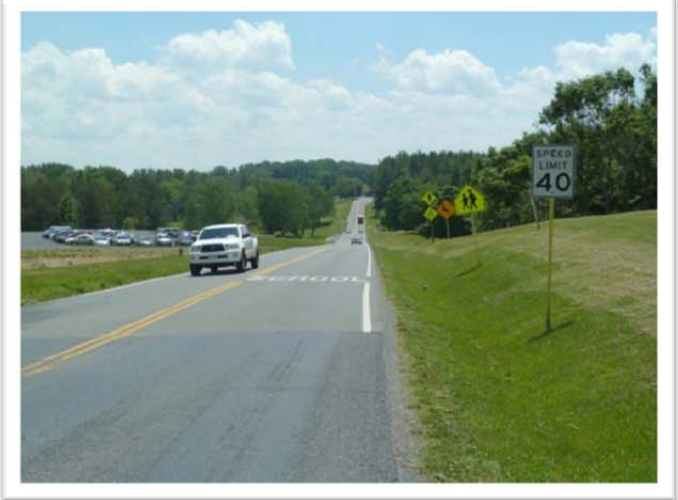
Pavement markings and signage on Woodrow Wilson Avenue (looking south)