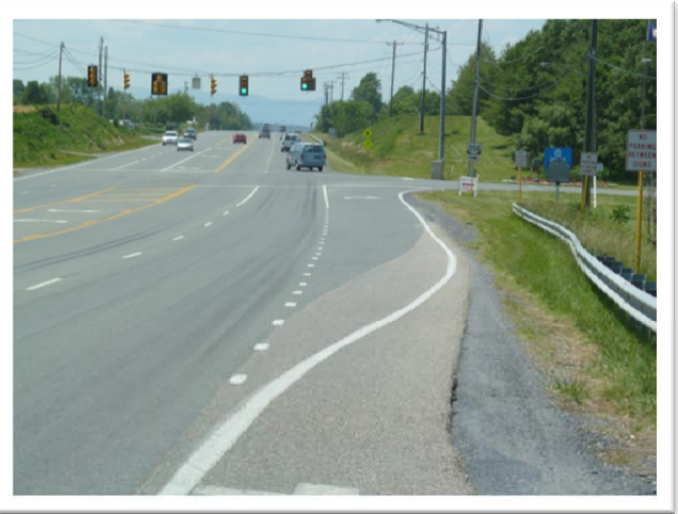
US250 intersection with Woodrow Wilson Avenue (looking west)

When drivers turn onto Woodrow Wilson Avenue the speed limit is 40mph, which seems relatively high for a small campus. Within the school zone (approximately 1,000 ft from the campus entrance), the speed limit is 25mph. Once cars reach VO Tech Road, the speed limit on the rest of the roads on campus is 25mph. The changing speed limit can be confusing for drivers, and it appears to encourage drivers to accelerate when leaving the campus. High