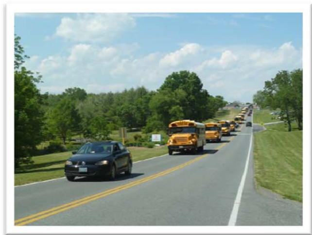
Woodrow Wilson Avenue during afternoon dismissal (looking north)

No sidewalks on Woodrow Wilson Avenue between US250 and Woodrow Wilson Elementary School (A) Woodrow Wilson Avenue fronts the school and every student walking or bicycling to school would need to travel along or across it to access the school building. Currently all students are dropped off at the school building by either a school bus or family vehicle. This is also the main route in and out of the campus and provides direct access to US250. The walkabout participants noted that during peak morning and evening travel hours, this road experiences relatively high traffic volumes. There are no sidewalks or paved shoulder on either side of the road. Drainage swales are present on both sides of the street. To walk along this route, students would need to walk on private property between the property side and the drainage swales.